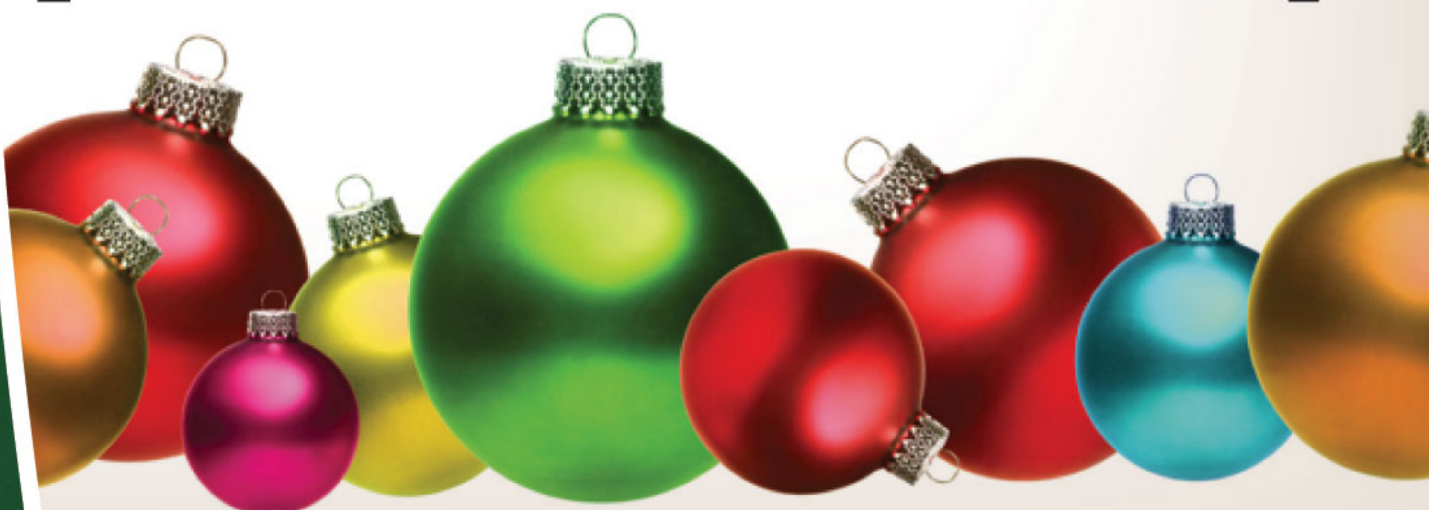
1: Coca-Cola 2: Germany 3: Blue 4: 1843 5: Clarice 6: It's a Wonderful Life 7: United Kingdom