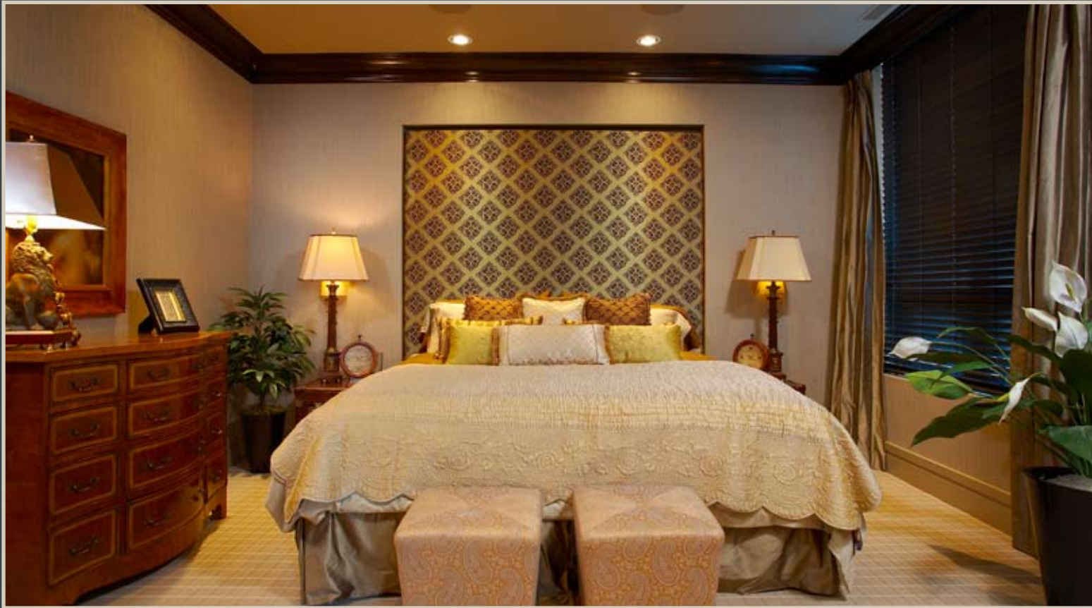
The Sumptuous Master Bedroom and Spa provide a quiet retreat from the everyday world with magnificent finishings and accoutrements.