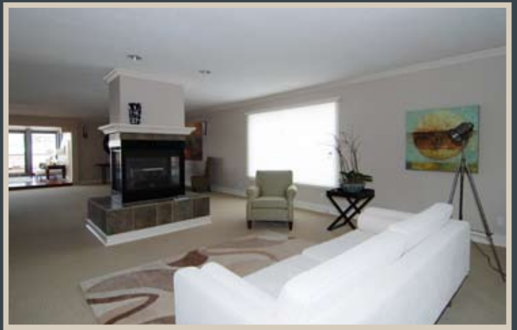
This fabulous open plan offers a living room with 2 way gas fireplace adjoining the dining room. The kitchen boasts granite counters and stainless steel appliances.