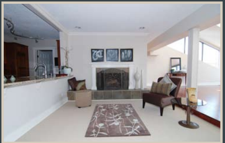
The sitting room feels cozy. Relax with a book next to the wood-burning fireplace. Adjoining solarium has cathedral ceilings, 4 skylights, and patio doors to a huge deck overlooking the city lights. You'll love to entertain here!