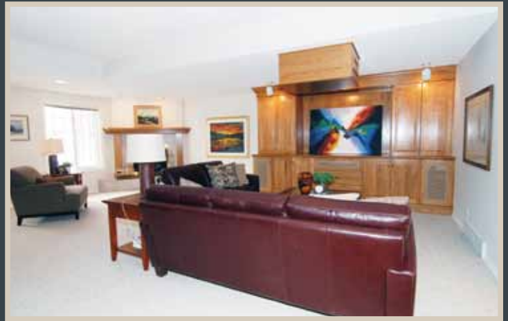
The lower walk-out level offers a great rec room with huge bar, TV area, and cozy fireplace. There's also a guest bedroom and full bath, plus lots of storage. The lower patio and upper deck both have gas hook-ups for your barbecue.