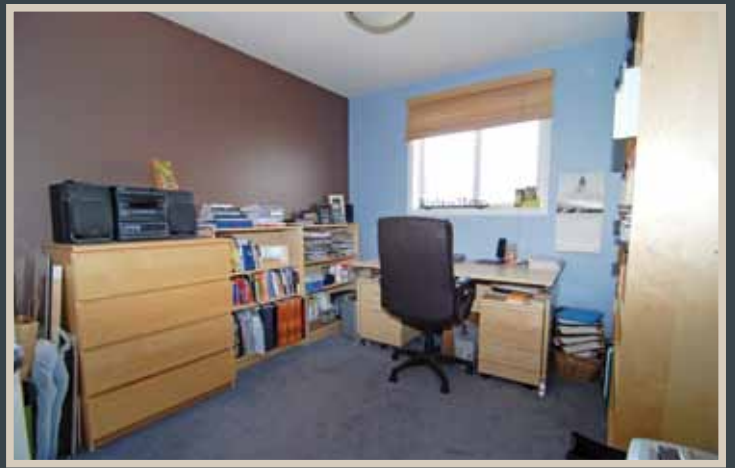
The two smaller bedrooms are perfect for children or guests or you may use as a handy at home office.