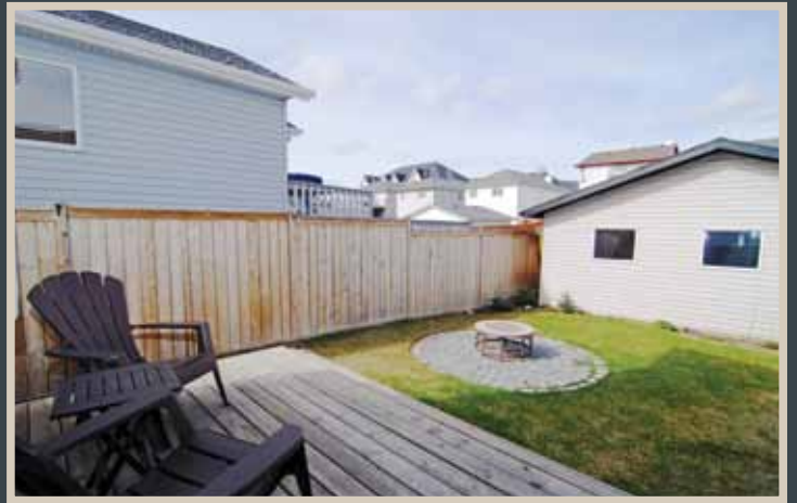
The back yard is perfect for barbecues or quiet evenings around